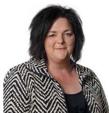
Kate Storey Realty 0362536095

Building Size : 67 sqm Land Size : 0.106 ha View : https://www.katestoreyrealty.com.au/sale/tas/hobart-southern/eaglehawk-neck/residential/house/8069373