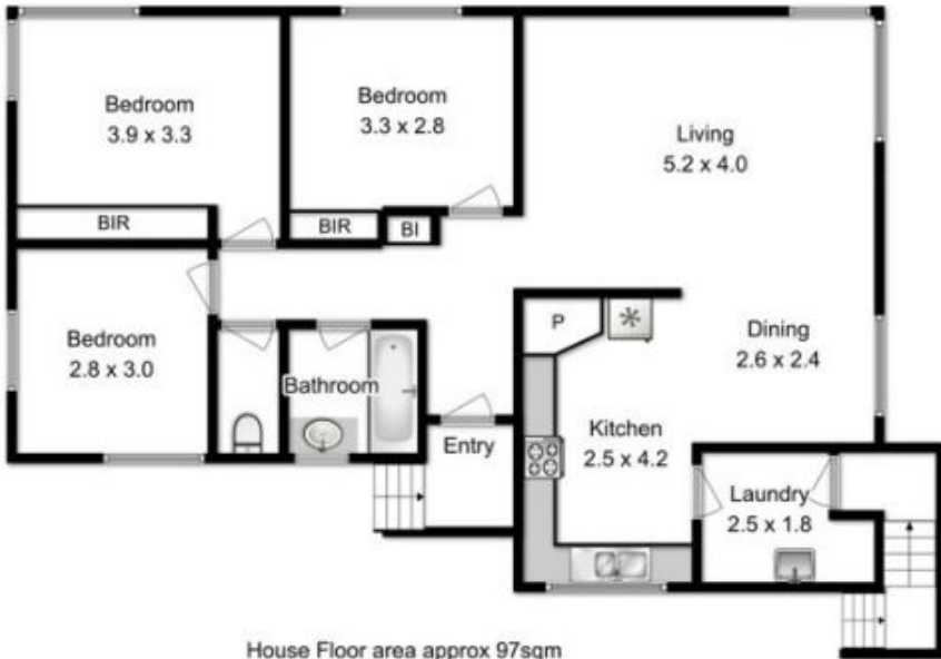
House Floor area approx 97sqm