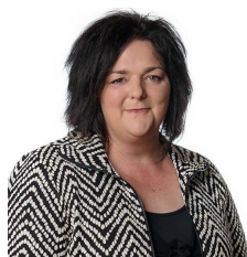
Kate Storey Realty 0362536095

View : https://www.katestoreyrealty.com.au/sale/tas/hobart-southern/eaglehawk-neck/residential/land/5647148